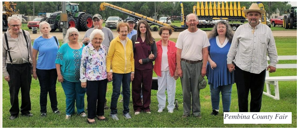
Pembina County Fair

Please send your email address to borghome@polarcomm.com If you would like to receive the Borg Email Newsletter.