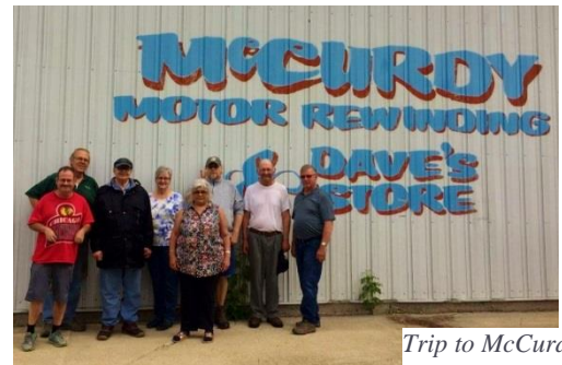
Trip to McCurdy's

Thank you to all that donated floral arrangements, food, treats, or any other items to Borg. Your thoughtfulness is appreciated.