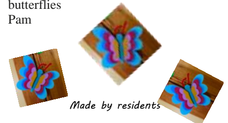
Made by residents