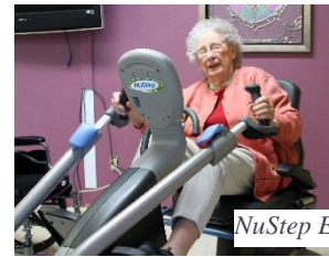
NuStep Exercise Bike