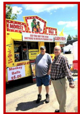
Cavalier Motorcycle Ride-In

Borg Home 61 Borg Drive Mountain, ND 58262